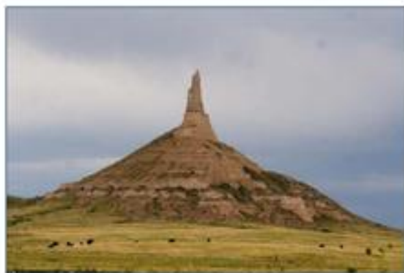
CHIMNEY ROCK, MORRILL COUNTY